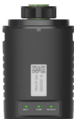
Model: Wi-fi module(Optional)

Details: Pair of 2/0AWG DC power cable and RJ45 communication cable for external battery expansion, power cable one end has a waterproof terminal, communication cable both ends have waterproof terminals . The cable length can be customized based on customer requirements, default length is 1500mm.