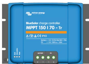
Solar Charge Controller MPPT 150/70-Tr