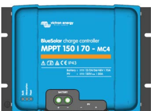
Solar Charge Controller MPPT 150/70-MC4