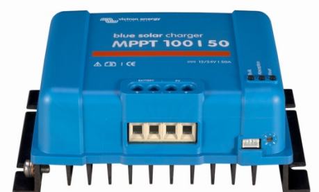
Solar Charge Controller MPPT 100/50